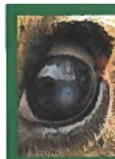
Blue/Cloudy, Red Rim