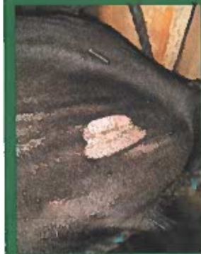
Hair growing back, no scales/scabs